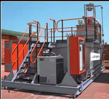
Skid mounted Flocculant Plant