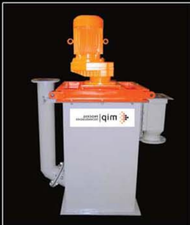
1m 3 Attrition Scrubber