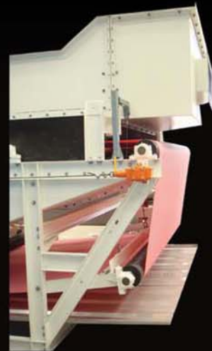
Side view with cloth