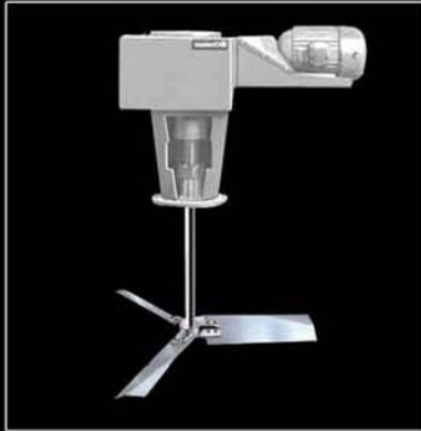
Chemineer HT Agitator