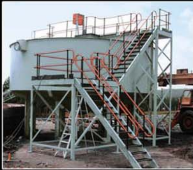
8m Thickener in operation